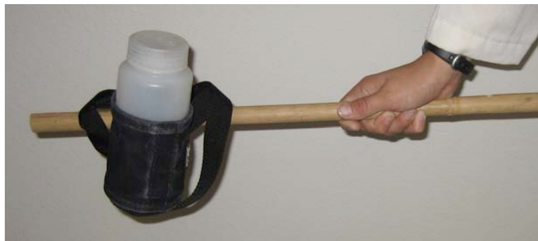
Here's an example of the type of water collector you can build at home